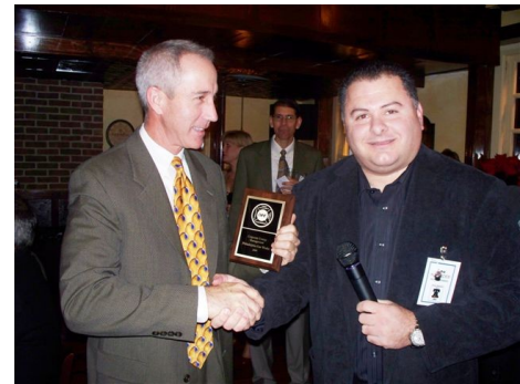
Corporate Energy Management - 2009 Philadelphia Gas Works